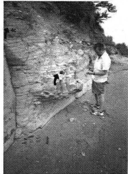
Figure 2a, b. The location of Lower Pontian samples, that were analyzed from palynological point of view.

The pollen of Dycotiledons is very numerous in all the samples (42 – 58%) and of a large diversity.